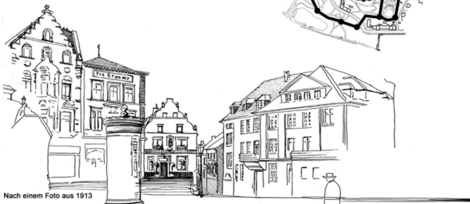
Nach einem Foto aus 1913